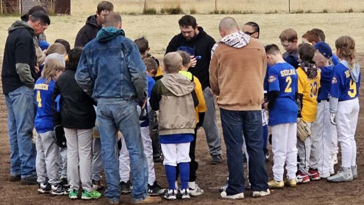
Spring Baseball kicked off with the Slmla Blue Team playing the Slmla Gold Team. Both teams met in the infield for prayer after.