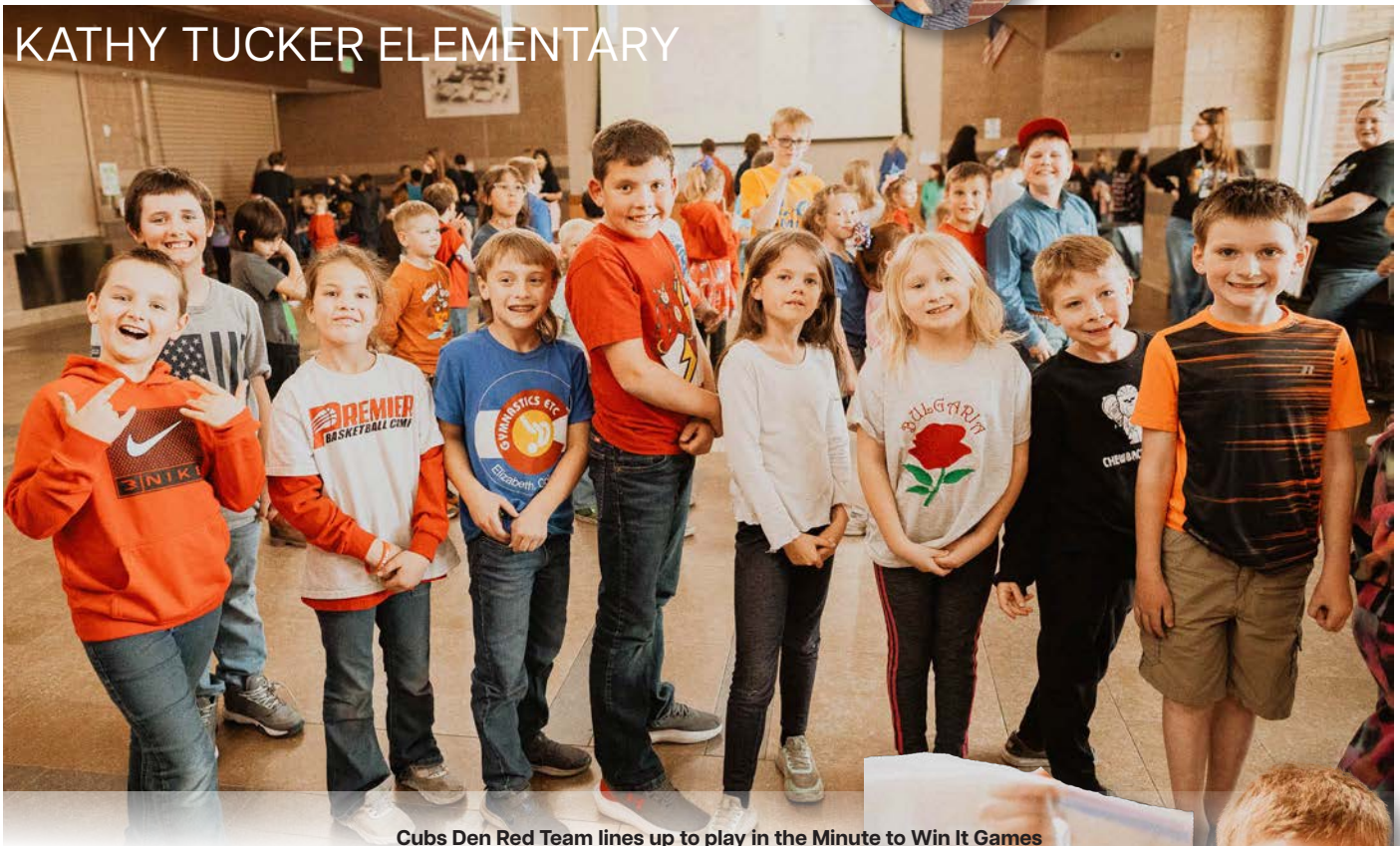
Cubs Den Red Team lines up to play in the Minute to Win It Games

“Challenge Accepted!” has truly been more than just a theme this year—it’s been the spirit behind everything we’ve done. As we look back, it’s hard not to smile at all we’ve shared together: the laughter that filled our halls, the milestones our students achieved, the challenges we tackled head-on, and yes—even a few tears along the way that helped us grow stronger.