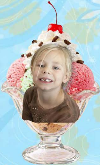
GRACIE GOODEICH GRAPE FLAVOR