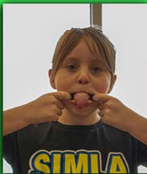
Pinching those who dont wear green- Prairice 1st