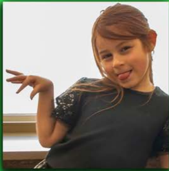
Catching the Leprechaun- Willow 1st