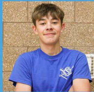
Logan: Go to Florida