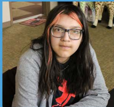
Arian: See Family