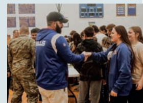
Greeting Veterans at the Veterans Day Assembly

Reminder – all 18-year old men must register for selective service within 30 days of their 18th birthday. You can register at sss.gov .