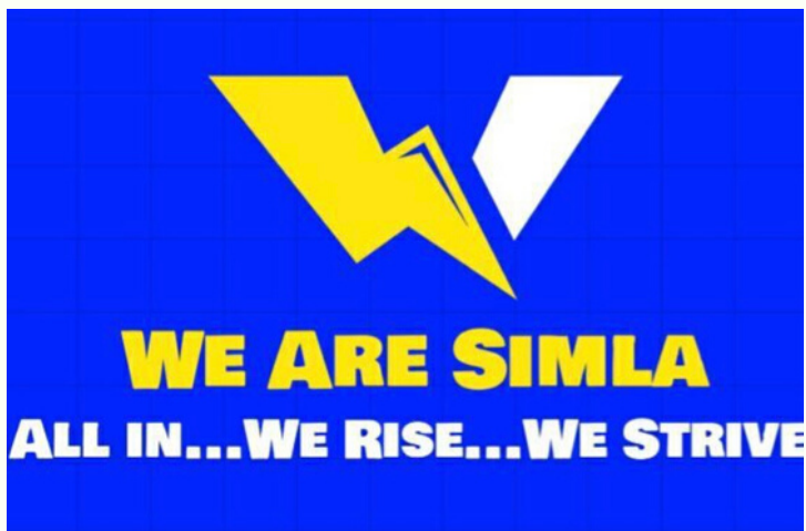
Logo 2 designed by Ryann Eurich

Grading of these assignments will be like normal. Teachers are going to be grading assignments that are turned in and will be entering the grades into Infinite Campus. If your child fails to turn in an assignment it may be entered as a zero or marked as missing. That does not mean that your child cannot turn in the assignment, it is to make you and your child aware of what is missing and how that zero will change their overall grade. Students will be allowed to turn in any and all assignments until the end of the quarter, but the grade will be marked as a zero until that assignment is turned in. As a staff, we want you to know what your children have turned in and what they haven't. So, if you see some zero's marked in the grade book this is a step to make you aware that they haven't turned that assignment in. We would appreciate any help in encouraging your child to do so.